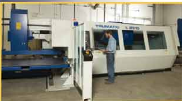
Laser Cutting (Qty. 3) From one-offs to longruns-- our lasers offer a first class finish, no investment in tooling, short set up, and great material yield