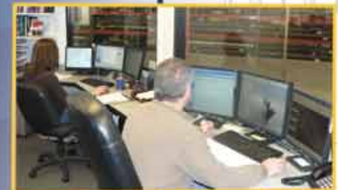
Estimating and Engineering Projects reviewed by team from manufacturing, engineering, and estimating to ensure the most cost efficient manufacturing method and optimum design for functionality