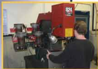
Hardware Insertion (Qty. 4) Ability to insert multiple fasteners in a single part handling resulting in zero defects and increased efficiency through reduced cycle and set up times