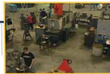
Machine Shop Our machining solutions in milling, turning, boring, and drilling are customized to fit your needs