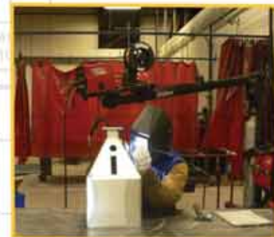
Welding Steel, stainless, and aluminum, 12 stations, mig, pulse mig, tig, and ability to spot weld-- steel and aluminum