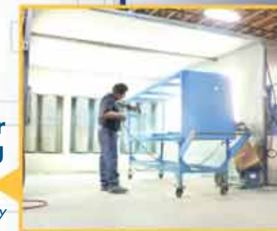
Powder Coating Batch For your extra-ordinary projects any shape or size