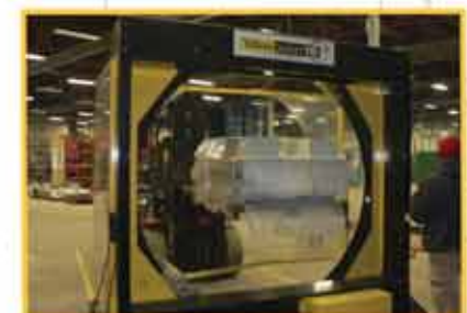
Shipping Company owned fleet enhances on time, reduces shipping damage/lost in transit allowing us to be more responsive to your needs