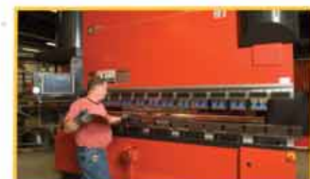
Forming (Qty. 4) High velocity and accurate bending with network offline programming and tool navigator that dramatically increases throughput