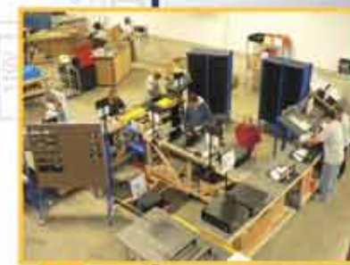
Assembly Cradle-to-Grave abilities with modular configuration to optimize one piece flow