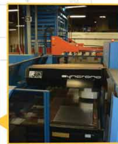
Automated Laser Cell Cuts any shape with ease, speed, and precision equipped with 10-story automated work handling system for lights out production