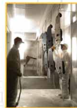
Powder Coating Line 10,000 sq ft in-house turnkey powder coating system with cross trained workforce to control quality, lead time, and cost from one piece to long runs, large or small