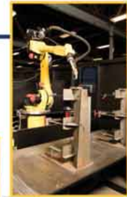
Robotic Welding Produces high volumes at competitive pricing in steel and aluminum