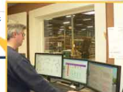
Production Management Real time tracking, identifies issues before bottlenecks occur, enhancing communication internally and externally