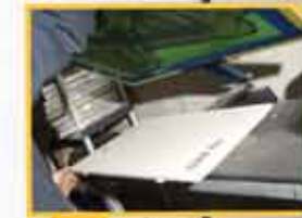
Silk Screening Creates savings for the customer with less handling, superior printing, and shorter lead times