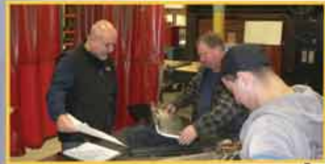
Prototype Shop Dedicated resources to make your ideas come to life

Capabilities Not Pictured: Time Saving, Deburring, Tumbling, Rolling, Stud Welding, Spot Welding and more